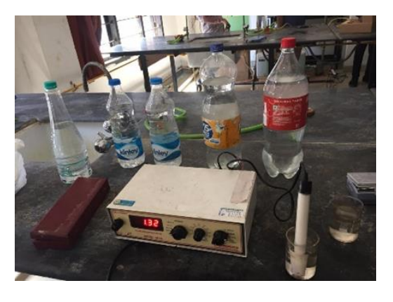
Fig.3. Determination of conductivity of water

Conductivity is a measure of water's capability to pass electrical flow. This ability is directly related to the concentration of ions in the water. These conductive ions come from dissolved salts and inorganic materials such as alkalis, chlorides, sulphides and carbonate compounds.