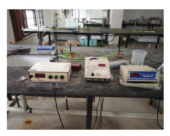
Fig.4. Determination of dissolved oxygen (DO) of water