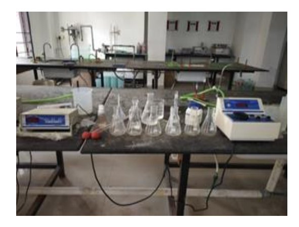
Fig.2. Chemical Process

International Journal of Progressive Research in Science and Engineering Volume-1, Issue-5, August-2020 www.ijprse.com