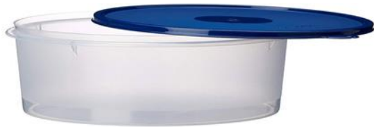
Fig.3. Plastic Container

Low density polyethylene (LDPE) is a high molecular weight polyolefin material. Like all polyolefin, LDPE is nontoxic, non-contaminating and exhibits a high degree of break resistance. It is lighter than water, easily withstands exposure a wide variety of common lab chemicals, and has a milky white translucent appearance. Low-density polyethylene (LDPE) is a thermoplastic made from the monomer ethylene. It was the first grade of polyethylene, produced in 1933 by Imperial Chemical Industries (ICI) using a high pressure process via free radical polymerization