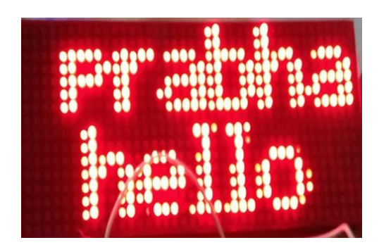
Fig.5. Display Board