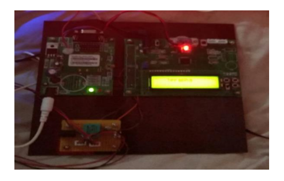
Fig.4. Hard ware working module

This message keeps scrolling on the display board until a new message is arrived by the MODEM.